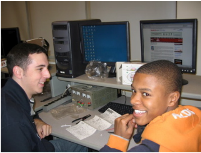
Fig. 4. Penn undergraduate students working with high-school students on one of three robotics projects completed over ten-two hour sessions.

Anecdotally, it appeared that enabling students to learn and discover on their own elicited passionate work. Below is a sample of typical comments from students: